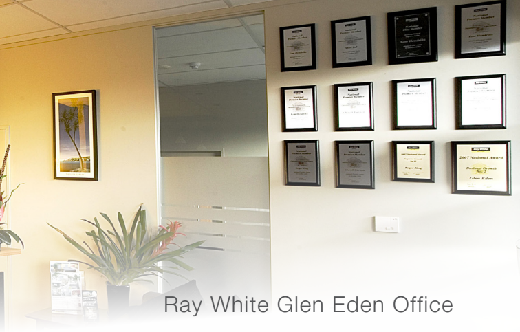
Ray White Glen Eden Office